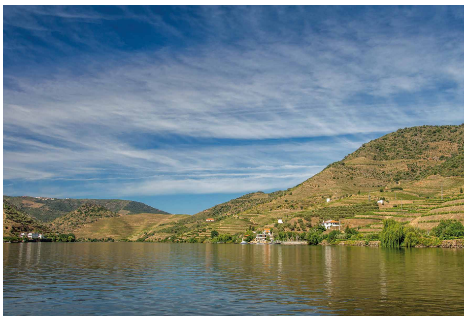
THE 'VINHA GRANDE' VINEYARDS (TOP RIGHT) AT SENHORA DA RIBEIRA

For over a century the Dow's Vintages have been blended primarily from two properties, Quinta do Bomfim, near