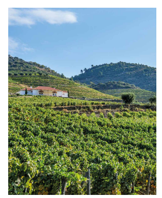
QUINTA DO BOMFIN

Pinhão, and Quinta da Senhora da Ribeira in the Douro Superior. These two vineyards consistently produce some of the finest wines when the climatic conditions are favourable. Their grapes are amongst the best that the Douro can produce. In recent years, two other properties — Quinta da Cerdeira and Quinta do Cabeço — both of which are a few kilometres from Senhora da Ribeira, have made important contributions to the blend. Cerdeira is a south-facing vineyard enjoying good exposure through the growing and ripening cycles during the summer, providing for well-ripened grapes that produce intense, well-structured wines. The Cabeço has a range of exposures to the sun giving an interesting selection of wines.