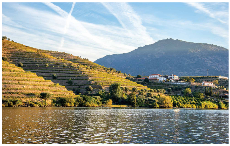
QUINTA DA SENHORA DA RIBEIRA