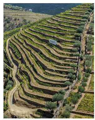
QUINTA DO RETIRO

Warre's 2017 has bright floral aromas of roses and violets, typical of the Touriga Nacional and also of rockrose, which is a feature of the Touriga Franca. On the palate the wine is full and plummy with amazing concentration and buoyant freshness delivering flavours of black