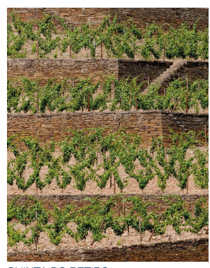
QUINTA DO RETIRO

Inevitably, given the year's particular conditions, the harvest started early. In fact, it was the earliest start to a vintage we have ever recorded in the Douro and was the first time we have picked red grapes in August. Very encouraging, though, was that graduations and phenolic development had kept pace with each other through the final ripening stretch in August, and this paved the way for complete and balanced fruit ripening. Furthermore, no rain was forecast for the first half of September, so there was no point in holding off.