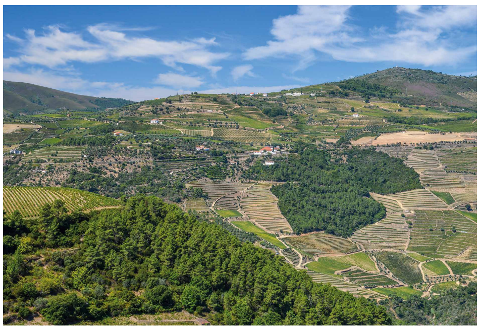
QUINTA DA CAVADINHA