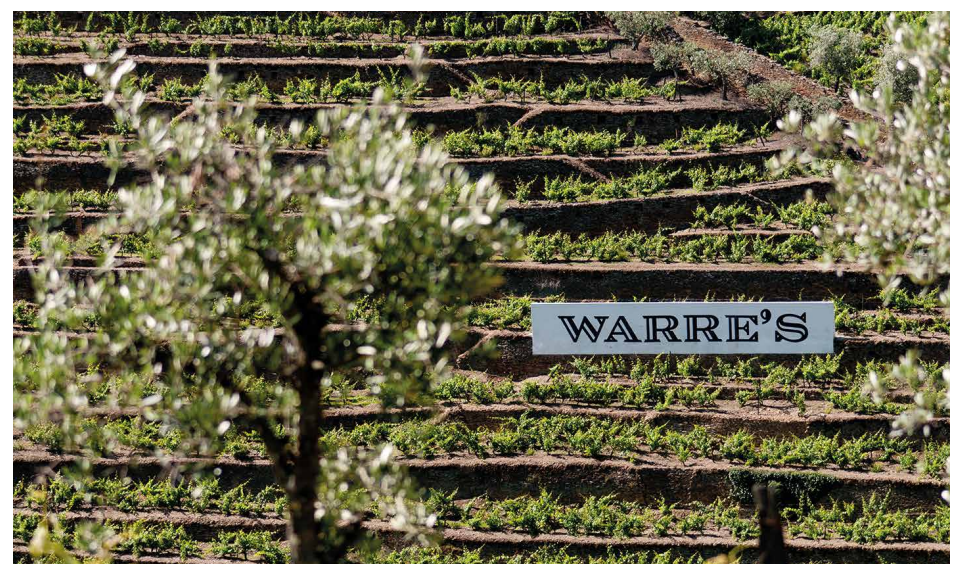
QUINTA DO RETIRO

We only had half the rainfall that we would expect in an average year; at Cavadinha just 332 mm fell compared to the 30-year annual average of 681 mm, and most of that was concentrated in the winter. The Warre's Quinta da Cavadinha and Retiro vineyards have the advantage of being at higher altitude than many Douro properties and with more sheltered aspects (cooler east and northeast facing slopes) that provided some respite from the hot and dry conditions of 2017.